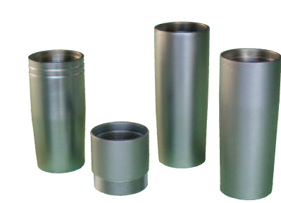
Different types of metal nuts are available on special request