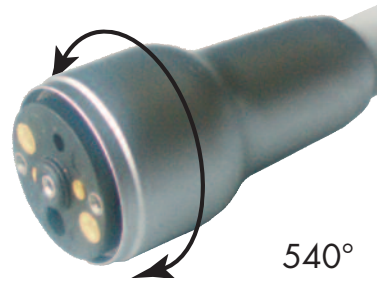
Silicone hose with connector for Bien-Air MC2 ISOLITE 300/LED micromotors