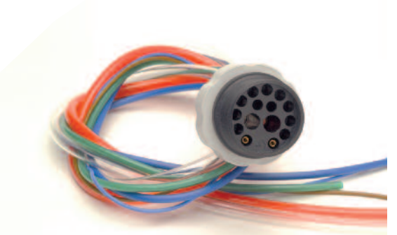
Female Multi-function connector