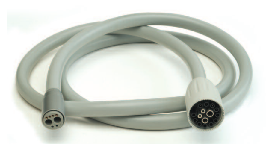
Complete Multi-function silicone hose

VARIOUS VERSIONS FOR SUPPLY OF OVER 1.5 DENTAL INSTRUMENTS ARE AVAILABLE.