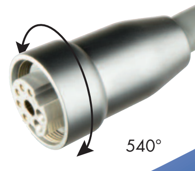
Silicone hose with connector for NUCLEUS®LED micromotors